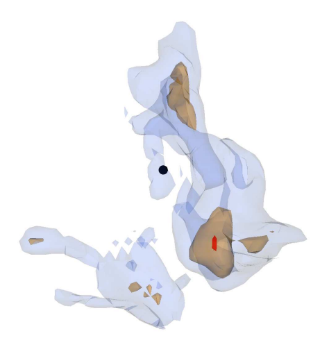
Figure 2: Temperature contours at the innermost \sim 75 km of the white dwarf at ignition. The black dot is the center of the star and has diameter 4.4 km, corresponding to the cell size from the MAESTRO simulation. The red contour encapsulates the region (one grid cell in this case) where T>8\times10^8 K, the gold contours encapsulate regions where T>7.8\times10^8 , and the blue contours encapsulate regions where T>7.5\times10^8 .

future. Based on this observation, we started another CASTRO simulation in which we define the ignition region as the single gold contour that is directly connected to the red ignition point. The subsequent flame evolution is shown in the right panel of Figure 3. The differences are striking, and before we continue the evolution of the explosion phase we must be certain that we are choosing a physically reasonable hot spot distribution. We also note that this flame model is preliminary and more work is needed to define a realistic flame model for these calculations. Nevertheless, these simulations serve as a proof-of-concept for our capability to perform end-to-end simulations of SNe Ia.